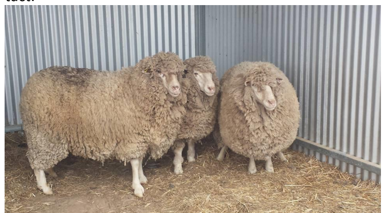
Mickey (wether), Minnie (ewe) & daughter Pluto on arrival at the Shelter.

Check out the before and after photos of new arrivals of Minnie, Mickey and Pluto. A lovely little family that had been left behind when their owners moved. They hadn't been shorn for at least two years with Pluto, the youngest still with her tail in tact.