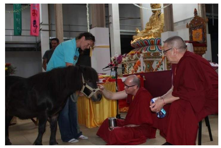
Phantom being blessed.

BAWCS headed along to the Vegecareian Festival again this year at The Great Stupa. We took along Phantom who proved to be a great hit and he was 'blessed' by the monks in the animal blessings ceremony.