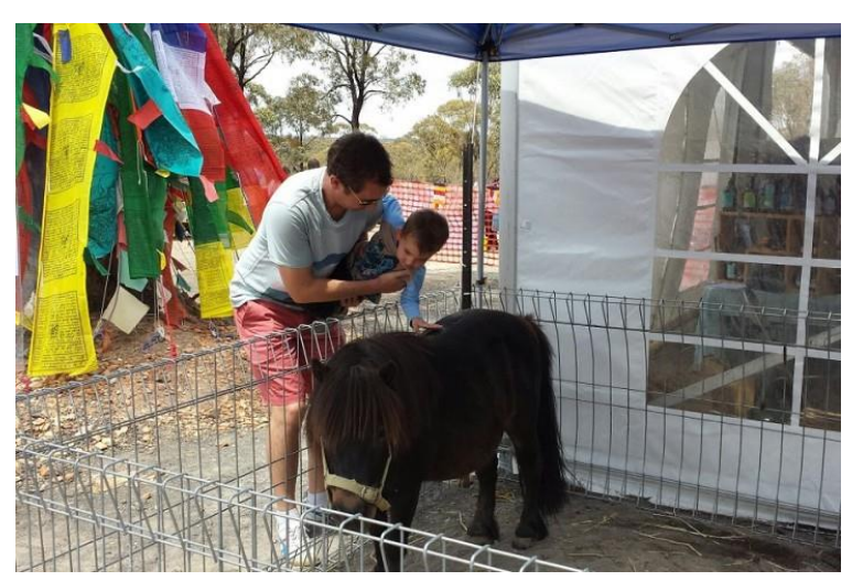
A hit with lots of people