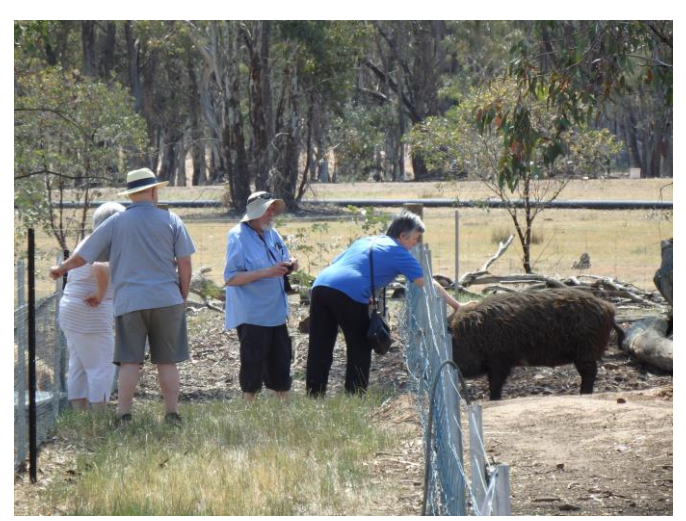
Our farm animals were a great hit with many being able to see in particular our pigs up 'close and personal'.

There were a huge range of bricks to look at including ones that reflect the work BAWCS does in the community with disadvantaged pet owners.