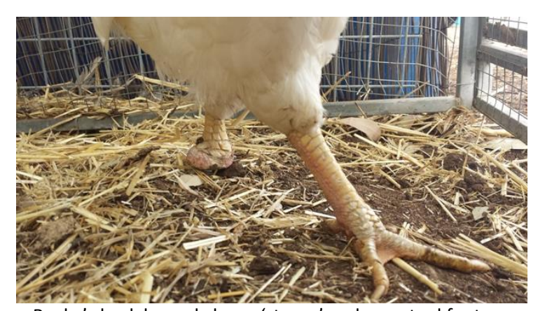
Rocky's back leg only has a 'stump' and no actual foot.