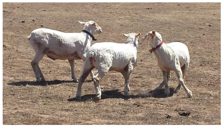
Feeling a lot lighter after being shorn!