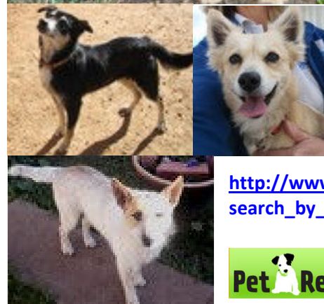
From left to right: Rex, Spike, Chuck, Charlie, Tiger, Darcy, Tom, Ruby and Sameerah

http://www.petrescue.com.au/search_by_member/?member=126