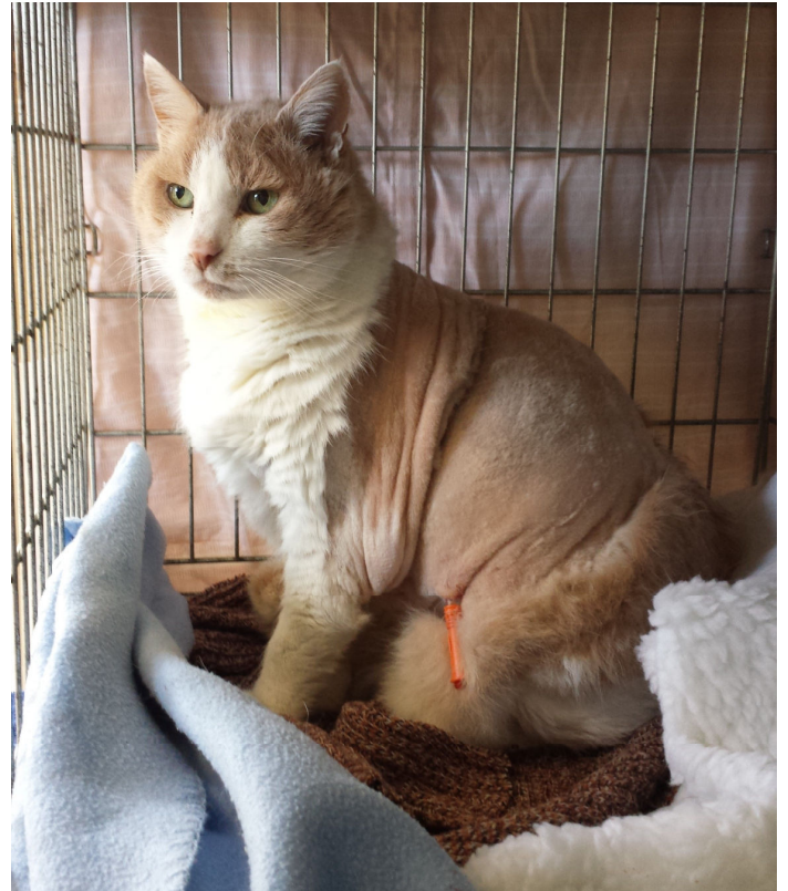
Basil after surgery, with his drainage tube still in