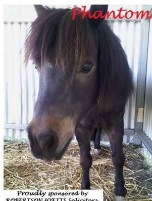
Proudly sponsored by ROBERTSON HYTEETS Solicitors

Phantom's first 6 months with BAWCS proudly sponsored by Robertson Hyetts Solicitors