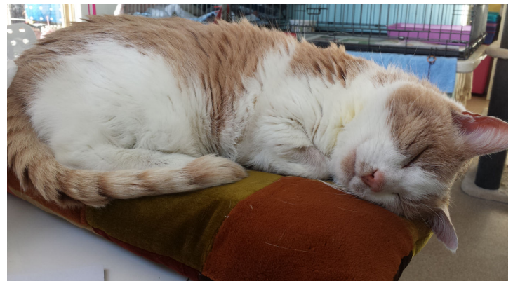
Basil can finally sleep comfortably on his side! He is available for adoption and you can apply for him via our website www.bawcs.org.au under Animals Available

With the stitches long since been removed and his fur slowly growing back, Basil is a handsome (and somewhat lighter) boy! He's still getting used to his new found agility and hasn't quite realised he can jump up on your lap himself...or does he just have us wrapped around his clever little paw?